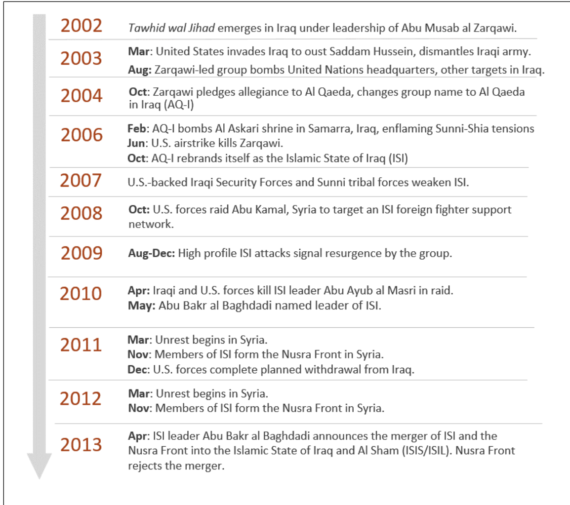
Figure A-I. Timeline: Islamic State-Related Developments, 2002-2013