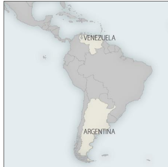
Figure 4. Latin America

In the 112 th Congress, the Countering Iran in the Western Hemisphere Act, requiring the Administration to develop a strategy to counter Iran's influence in Latin America, was enacted (H.R. 3783, P.L. 112-220). The required report was provided to Congress in June 2013, asserting that "Iranian influence in Latin America and the Caribbean is waning" in part because of U.S. efforts to cause Latin American countries to assess the costs and benefits of closer relations with