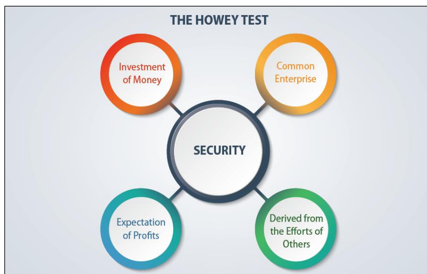
Figure 1. The Howey Test