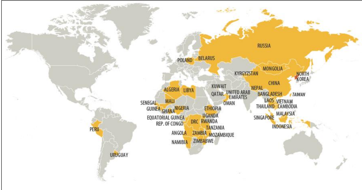
Figure 3. Countries with DPRK Workers in 2018