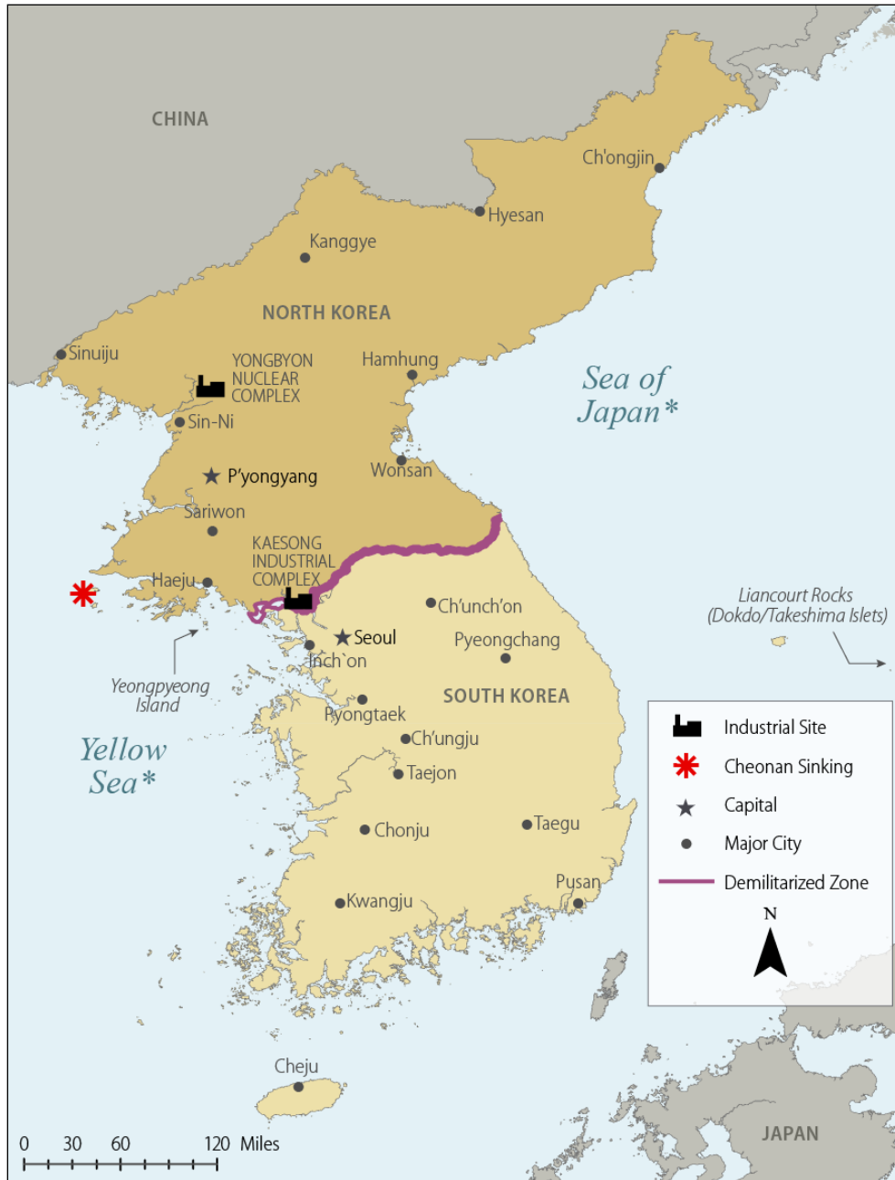
Figure I. Map of the Korean Peninsula