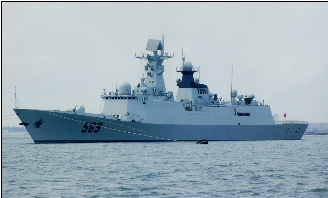
Figure 10. Jiangkai II (Type 054A) Class Frigate