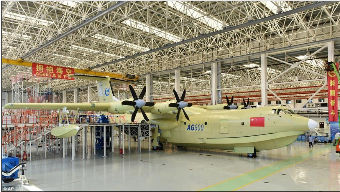
Figure 16. AG-600 Amphibious Aircraft