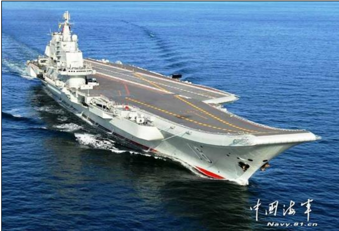
Figure 5. Liaoning (Type 001) Aircraft Carrier

This picture shows the ship during a sea trial in October 2012.