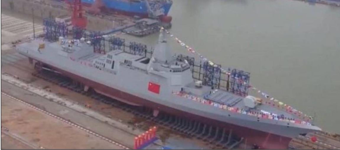
Figure 8. Renhai (Type 055) Cruiser (or Large Destroyer)