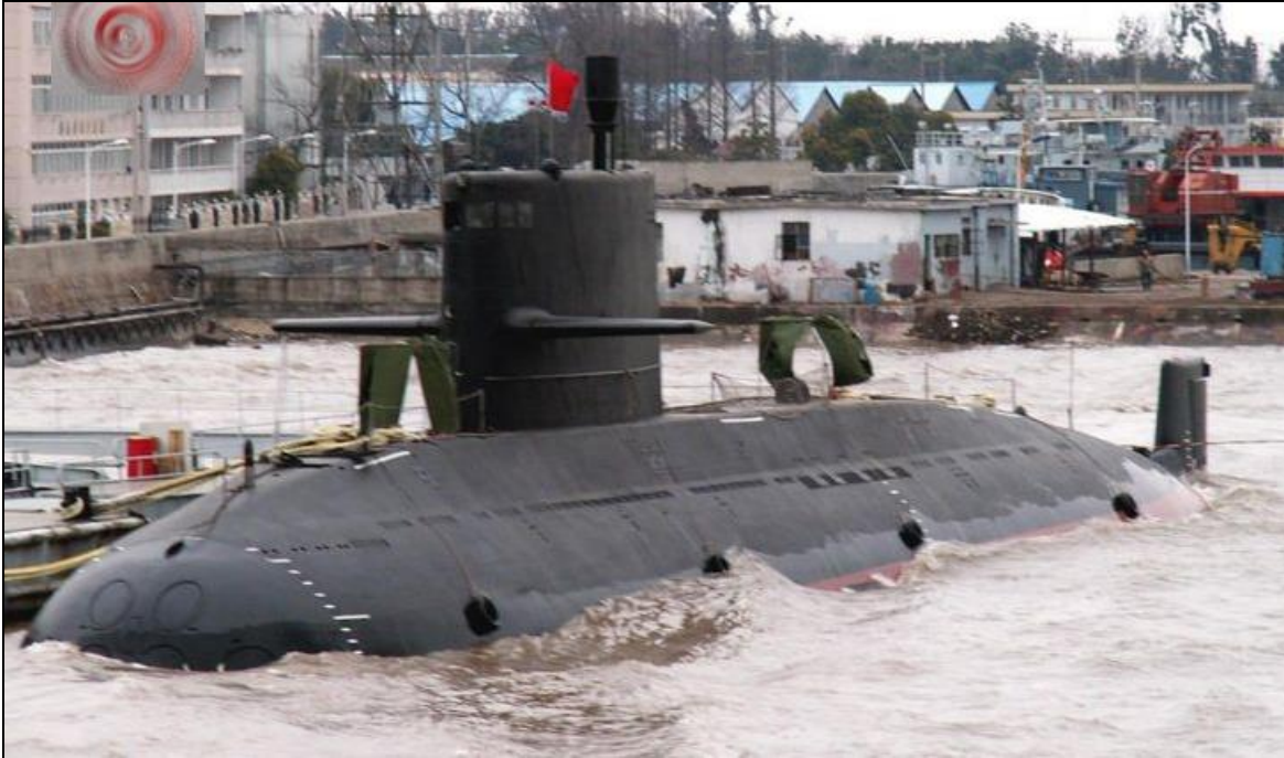
Figure 2. Yuan (Type 039A) Class Attack Submarine