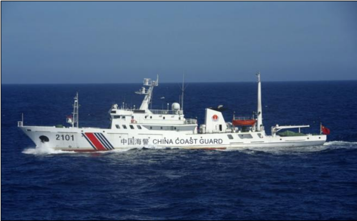
Figure 13. China Coast Guard Ship