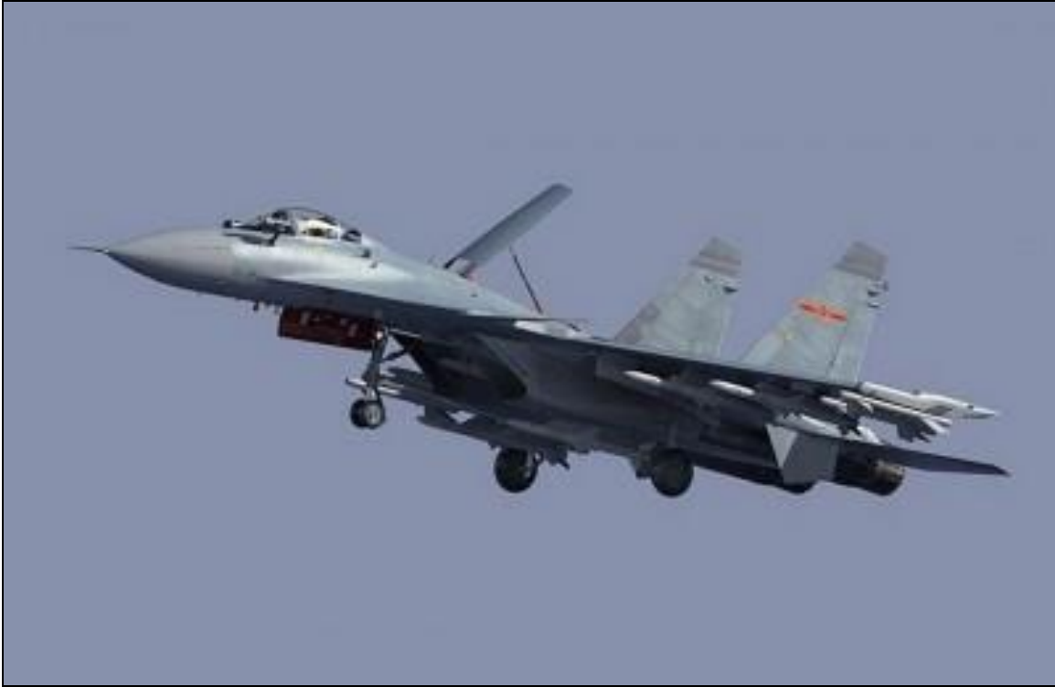
Figure 7. J-15 Carrier-Capable Fighter