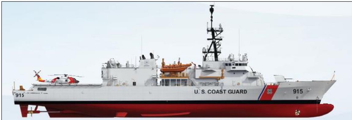
Figure 3. Offshore Patrol Cutter Artist's rendering