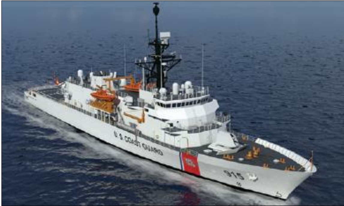
Figure 2. Offshore Patrol Cutter Artist's rendering