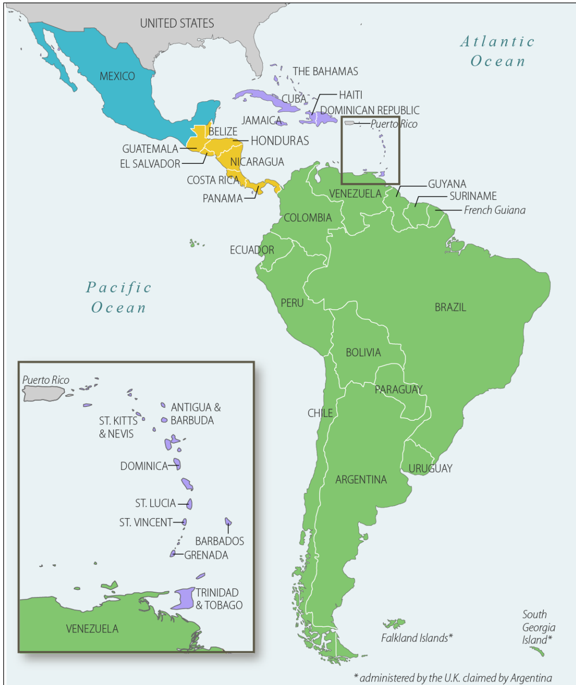
Figure I. Map of Latin America and the Caribbean

recent years, precipitated by the increase in organized crime-related violence and by politically driven attempts to curb critical or independent media.