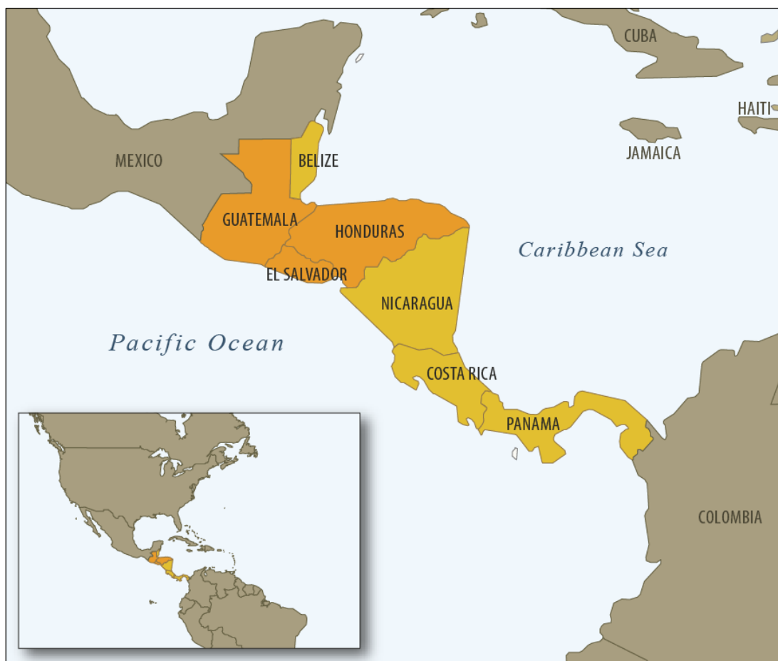
Figure 3. Map of Central America

The Obama Administration determined it was in the national security interests of the United States to work with Central American nations to improve security, strengthen governance, and promote prosperity in the region. Accordingly, the Obama Administration launched a new, whole-of-government U.S. Strategy for Engagement in Central America and requested a significant increase in foreign assistance for the region to support the strategy's implementation. Congress appropriated $1.4 billion of aid for Central America in FY2016 and FY2017, allocating most of the funds to El Salvador, Guatemala, and Honduras (the northern triangle countries of Central America, see Figure 3 ). Congress required a portion of the aid to be withheld, however, until the northern triangle governments took steps to improve border security, combat corruption, protect human rights, and address other congressional concerns.