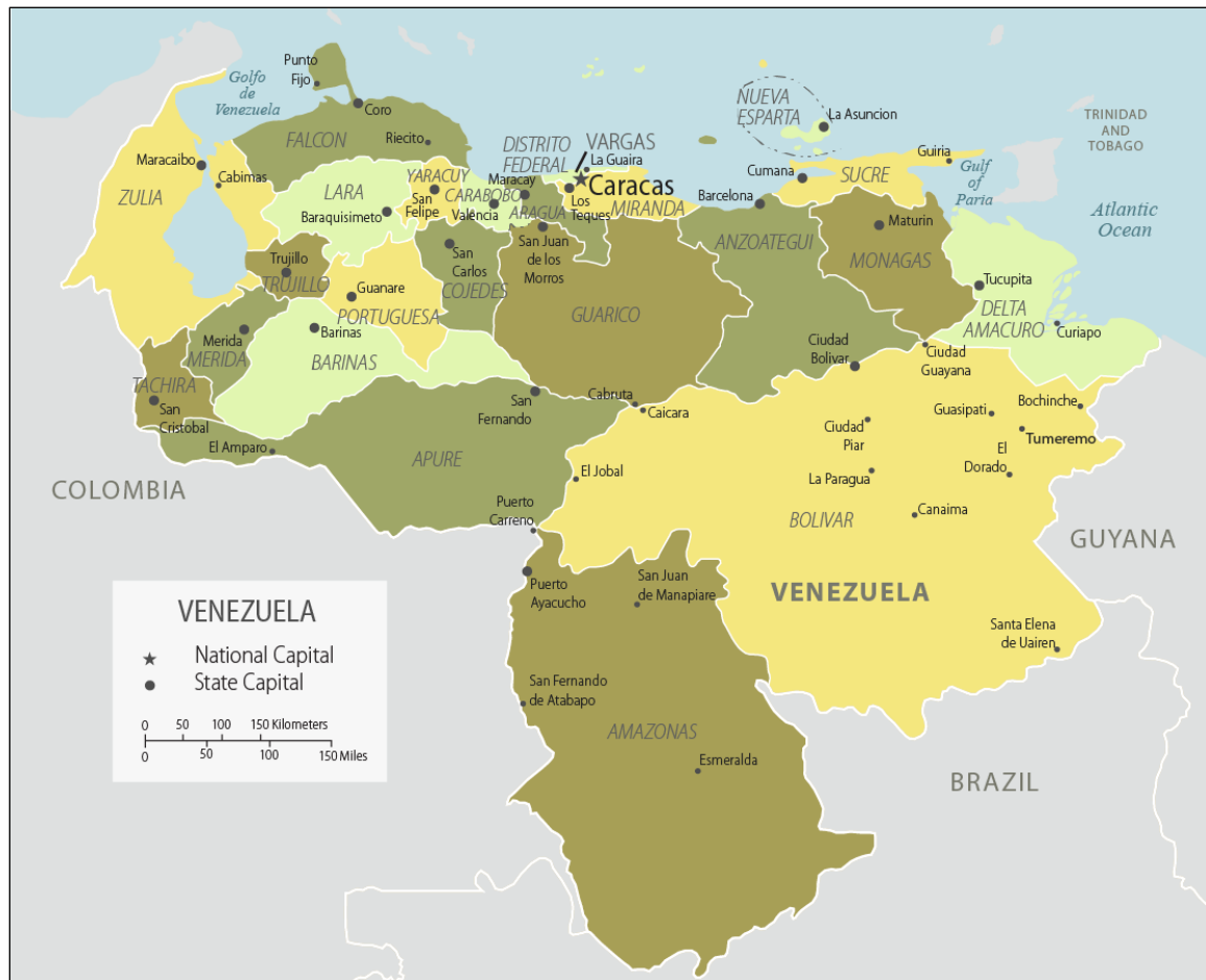
Figure I. Political Map of Venezuela