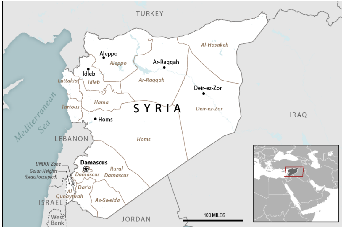
Figure I. Syria: Map and Country Data