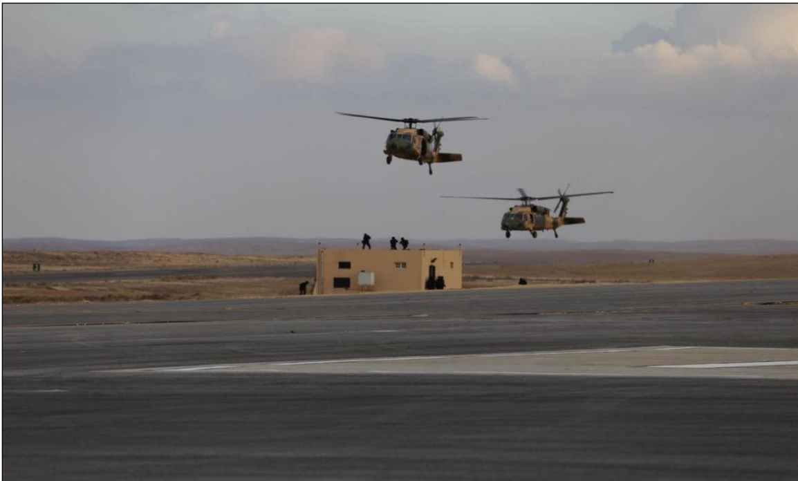
Figure 6. Blackhawk Helicopters arriving in Jordan January 2018

U.S.-Jordanian military cooperation is a key component in bilateral relations. U.S. military assistance is primarily directed toward enabling the Jordanian military to procure and maintain conventional weapons systems. 37 The United States and Jordan have jointly developed a five-year procurement plan for the Jordanian Armed Forces in order to prioritize Jordan's needs and procurement budget using congressionally-appropriated Foreign Military Financing (FMF). Proposed arms sales notified to Congress include 35 Meter Coastal Patrol Boats; M31 Unitary Guided Multiple Launch Rocket Systems (GMLRS) Rocket Pods; UH-60M VIP Blackhawk helicopter; and repair and return of F-16 engines. 38 On February 18, 2016, President Obama signed the United States-Jordan Defense Cooperation Act of 2015 (P.L. 114-123), which authorizes expedited review and an increased value threshold for proposed arms sales to Jordan for a period of three years. In January 2018, the United States delivered two S-70 Blackhawk helicopters to Jordan, bringing their total Blackhawk fleet up to 28 aircraft.