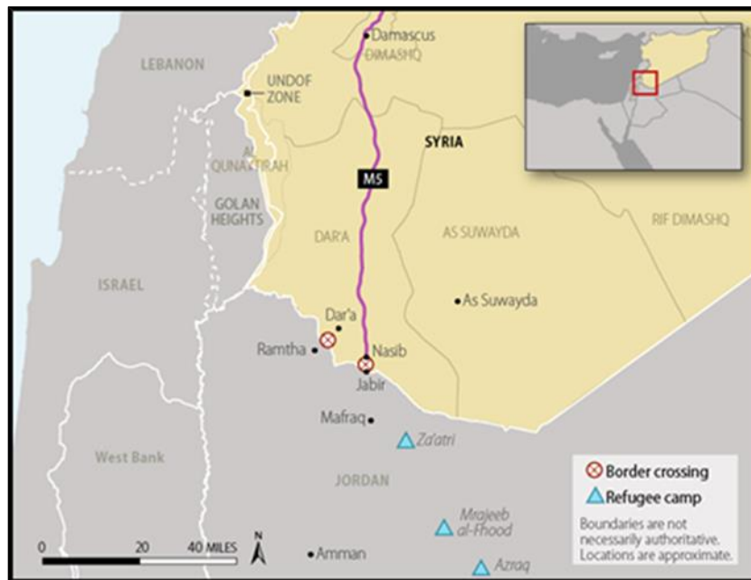
Figure 2. Syria-Jordan Border

United Nations expressed appreciation to Jordan for allowing UN agencies to provide an exceptional delivery of humanitarian aid.