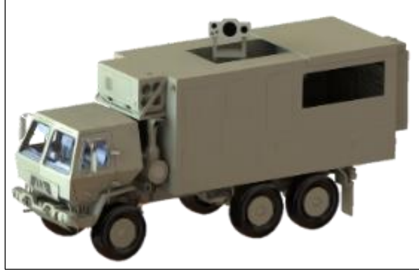
Figure 5. Prototype High Energy Laser Tactical Vehicle Demonstrator (HEL TVD)