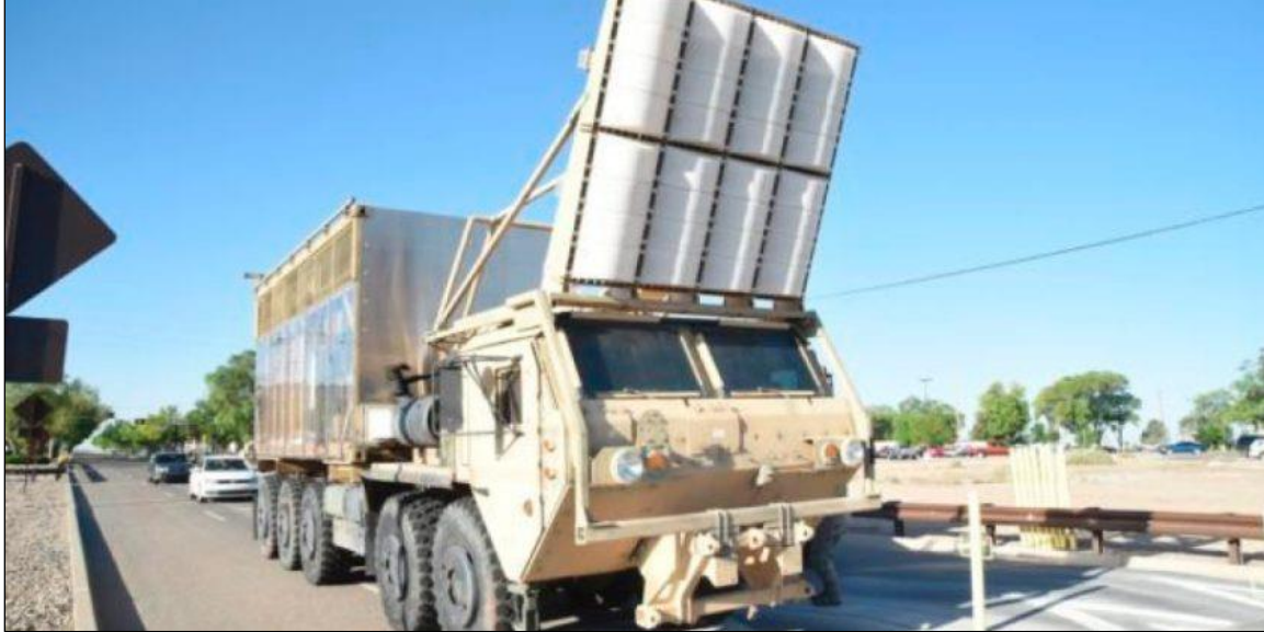
Figure 4. Prototype Max Power System