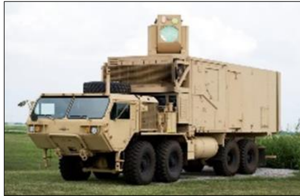
Figure 8. High Energy Laser Mobile Test Truck (HELMTT)