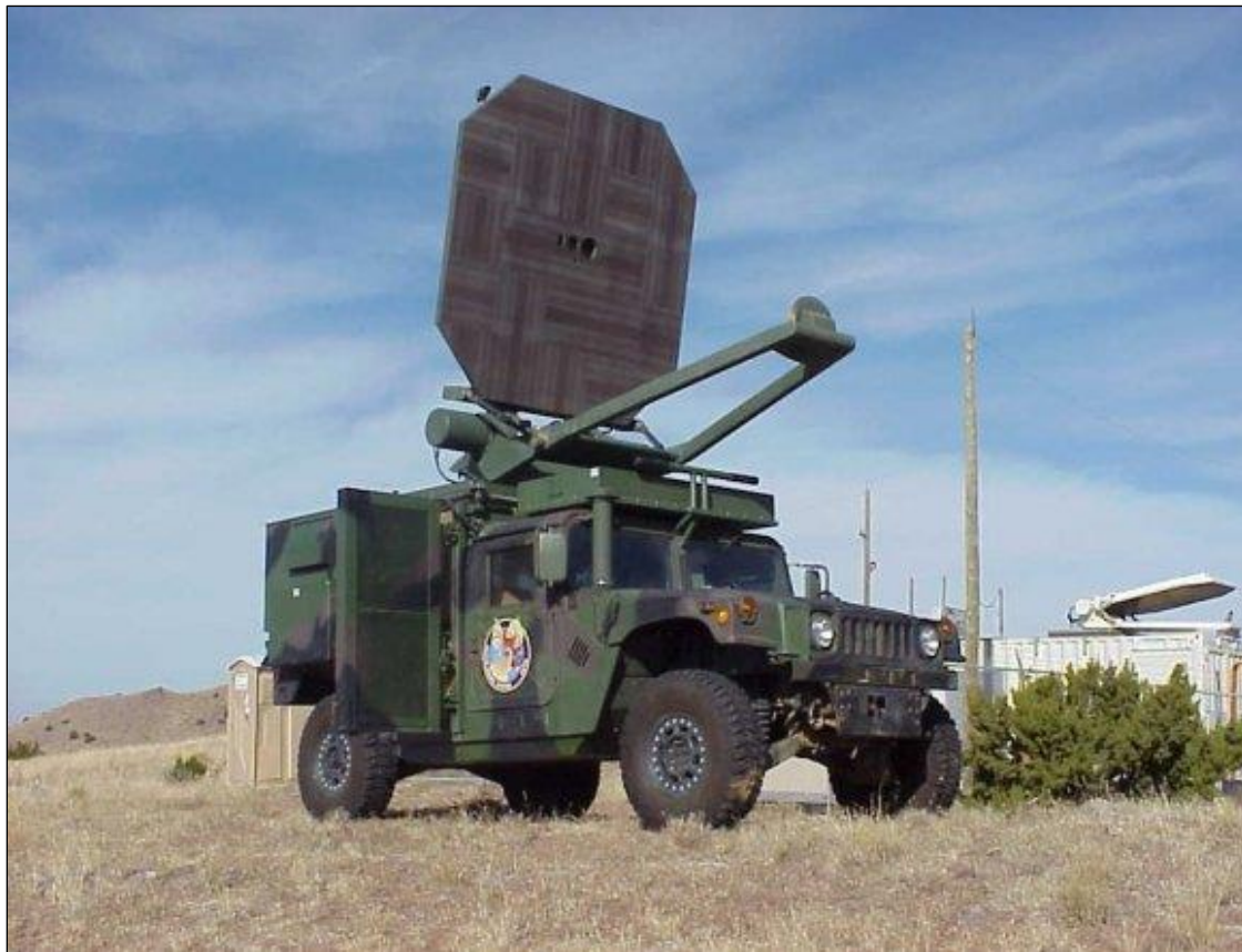
Figure 3. Prototype Army Active Denial System (ADS)