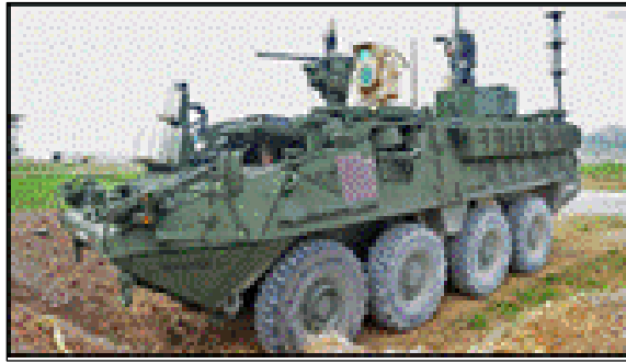
Figure 7. Mobile Experimental High Energy Laser (MEHEL 2.0)