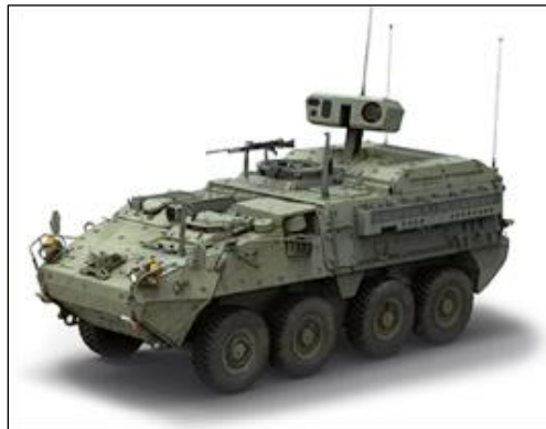
Figure 6. Prototype Multi-Mission High Energy Laser (MMHEL)