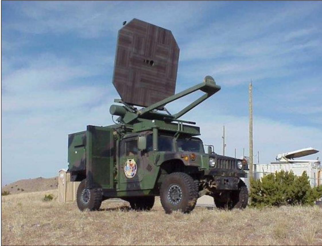
Figure 3. Prototype Army Active Denial System (ADS)