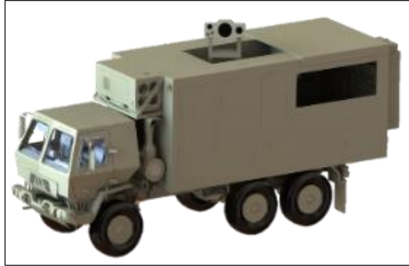
Figure 5. Prototype High Energy Laser Tactical Vehicle Demonstrator (HEL TVD)