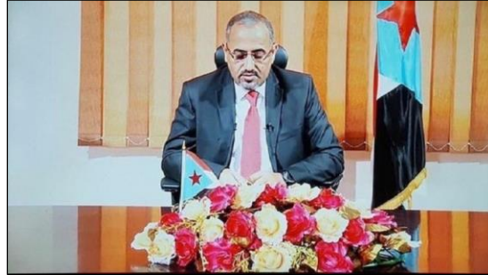
Figure 2. Major General Aidarous al Zubaidi First Session of the Southern Transitional Council