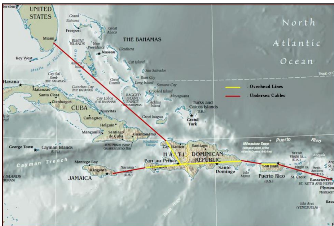
Figure 3. Potential Route for Interconnection from the United States