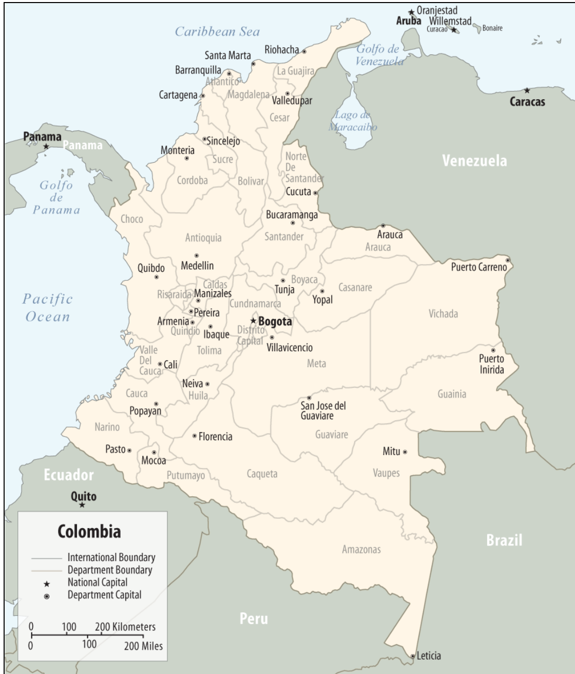
Figure I. Map of Colombia

illegally armed groups made aggressive efforts to take control of former FARC territory and its criminal enterprises as FARC forces withdrew. (For more, see “The Current Security Environment,” below.)