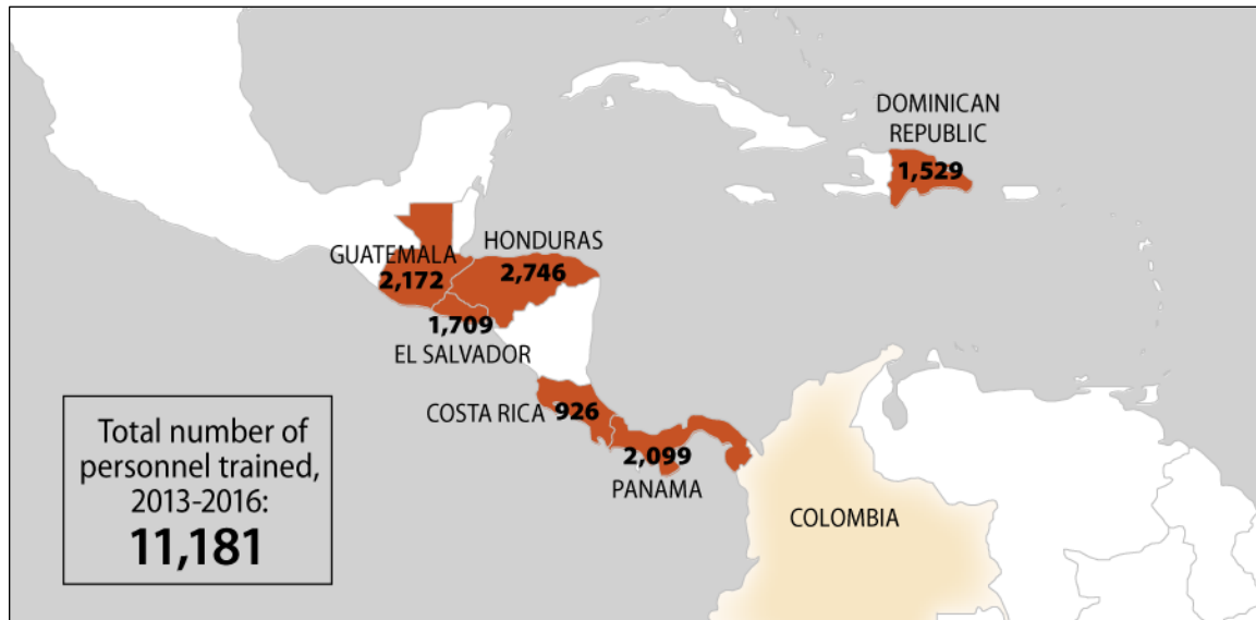
Figure 2. Third-Country Security Forces Trained Under the Action Plan on Regional Security Cooperation, 2013-2016

Source: Data from the Colombian Ministry of Defense provided by the Embassy of Colombia.