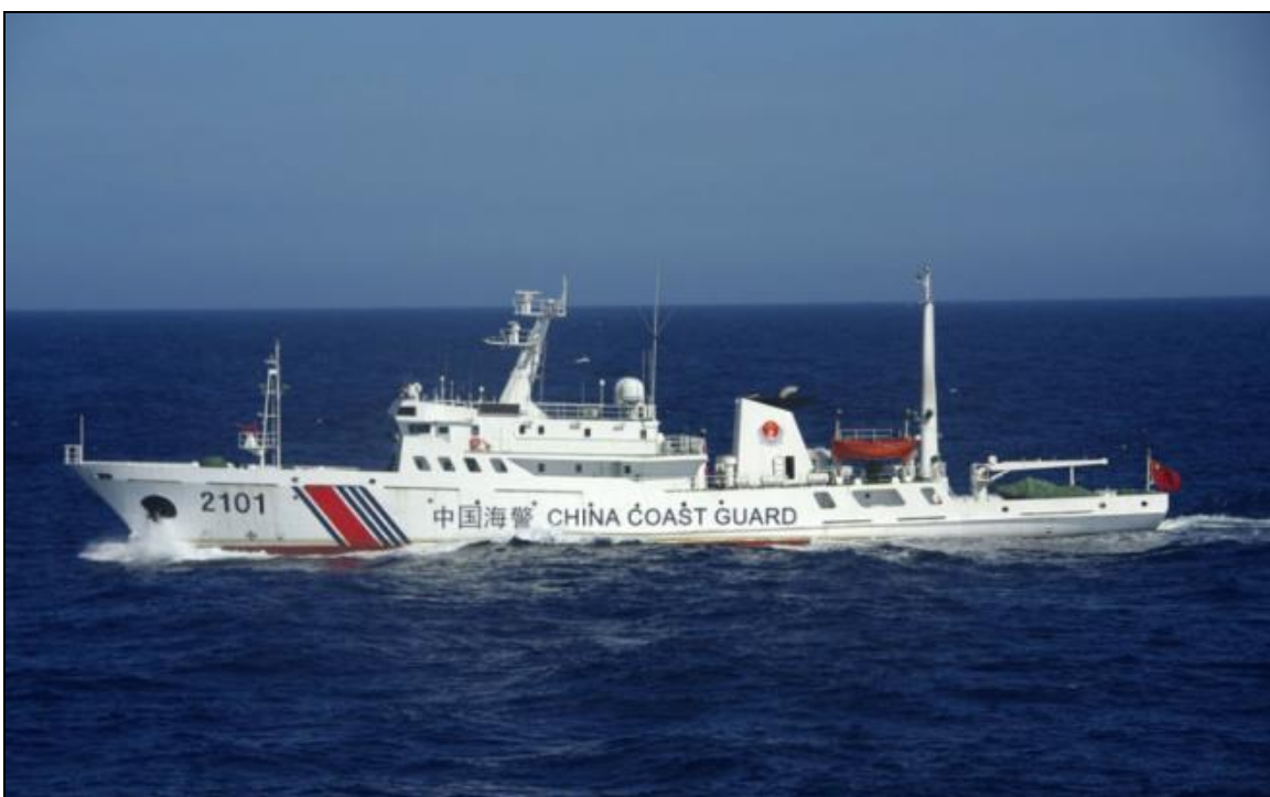
Figure 13. China Coast Guard Ship