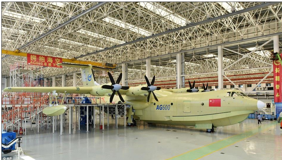
Figure 16. AG-600 Amphibious Aircraft