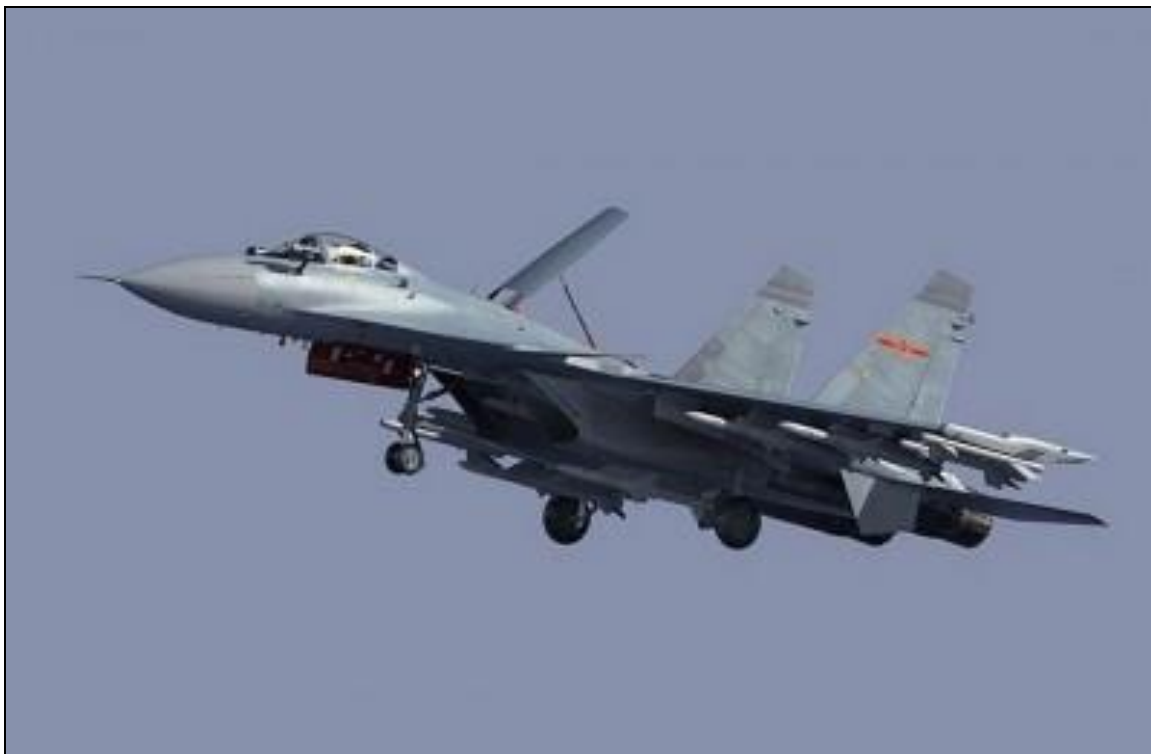
Figure 7. J-15 Carrier-Capable Fighter