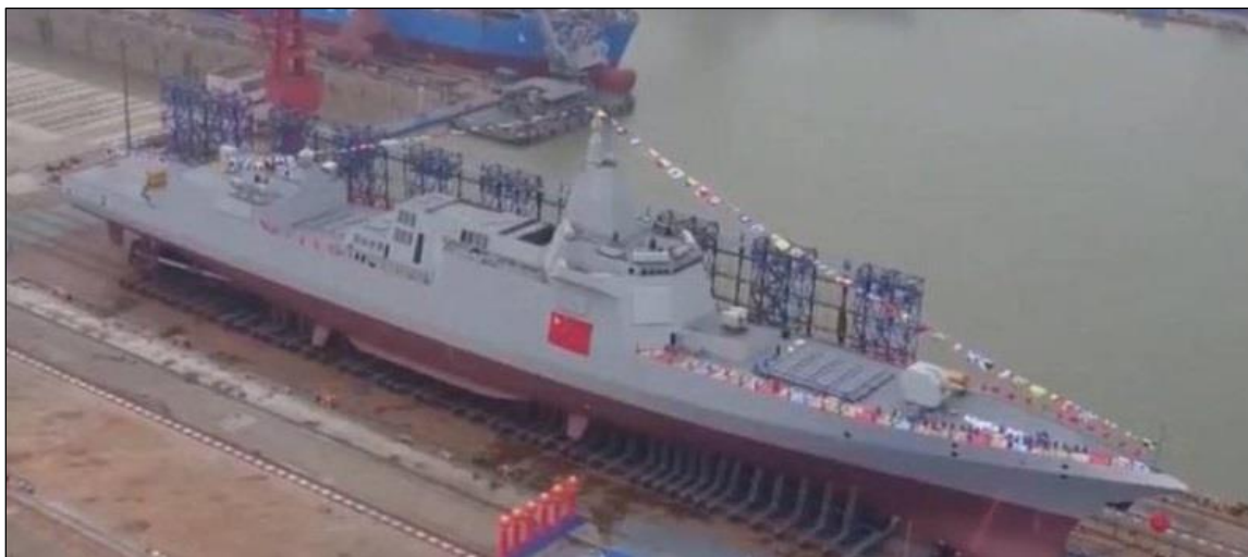
Figure 8. Renhai (Type 055) Cruiser (or Large Destroyer)