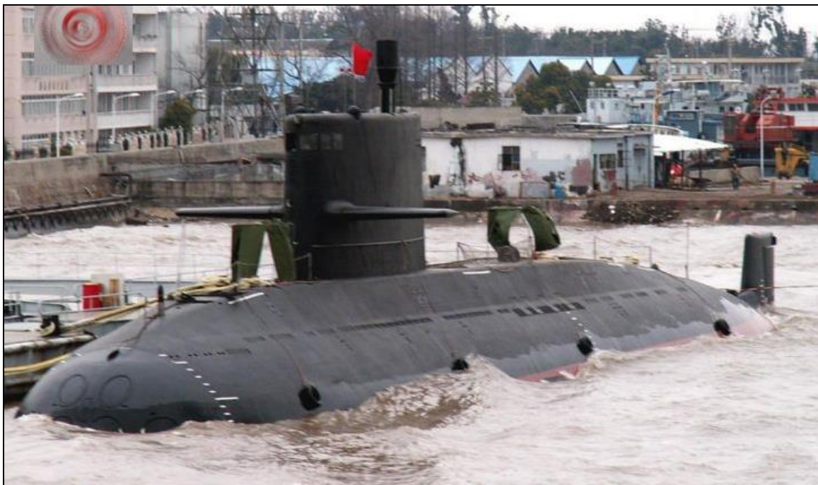
Figure 2. Yuan (Type 039A) Class Attack Submarine