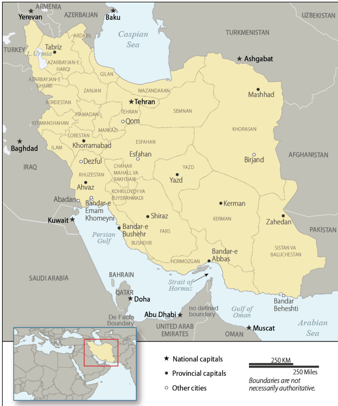
Figure 2. Map of Iran