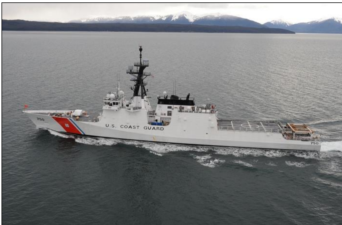
Figure 1. National Security Cutter