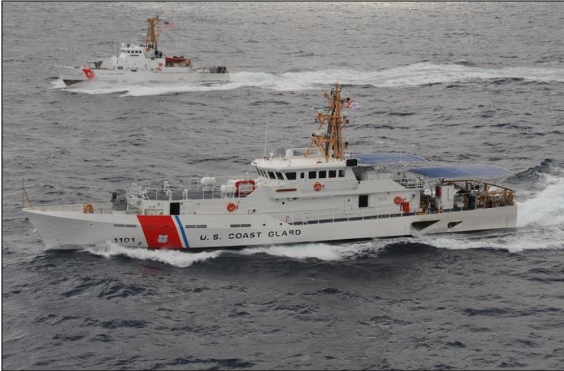
Figure 5. Fast Response Cutter (With an older Island-class patrol boat behind)