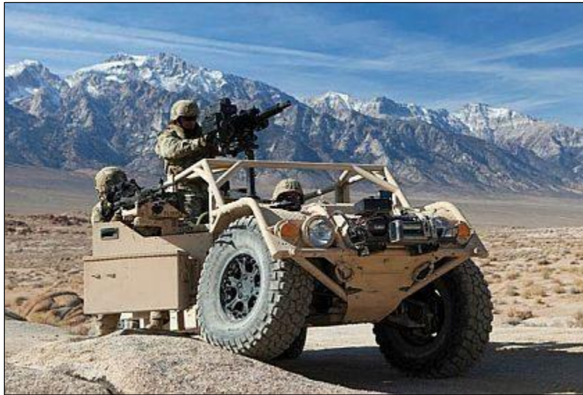
Figure I. Illustrative GMV