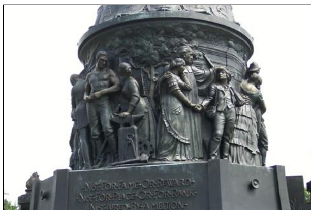
Figure 4. Details of the Base of the Arlington Confederate Memorial