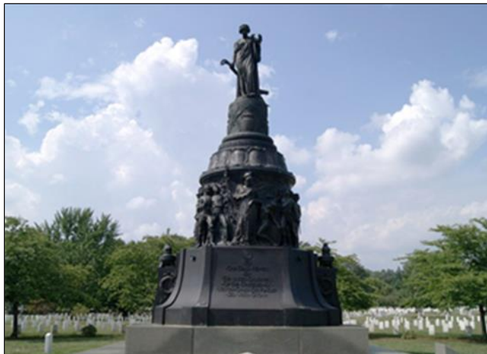
Figure 3. Confederate Memorial in Arlington National Cemetery