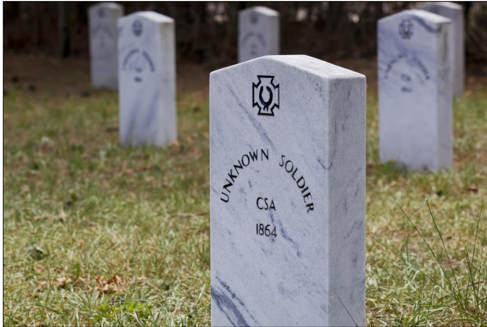
Figure 2. The Southern Cross of Honor on a Confederate Headstone