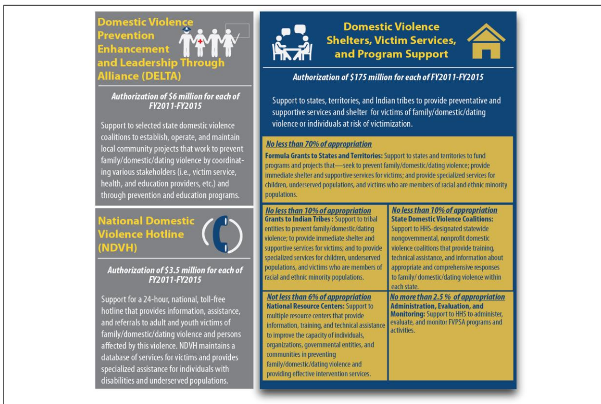
Figure I. Summary of Activities Authorized and Funded Under the Family Violence Prevention and Services Act (FVPSA)