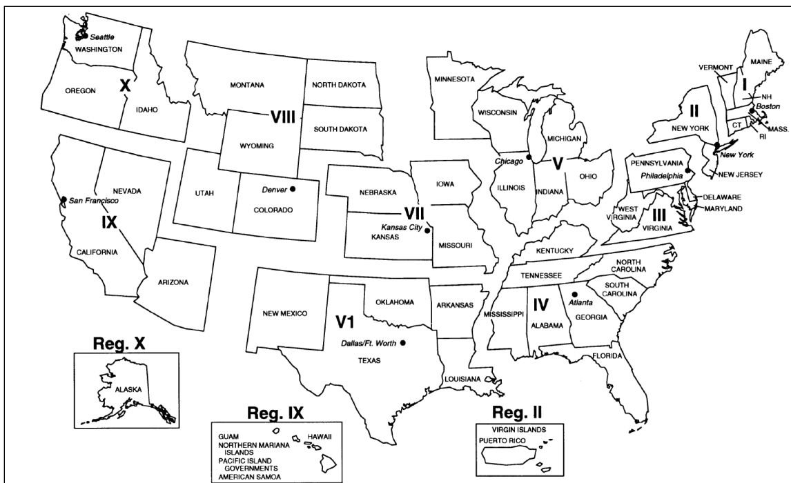
Figure 2. Standard State and Territorial Boundaries for Federal Regions