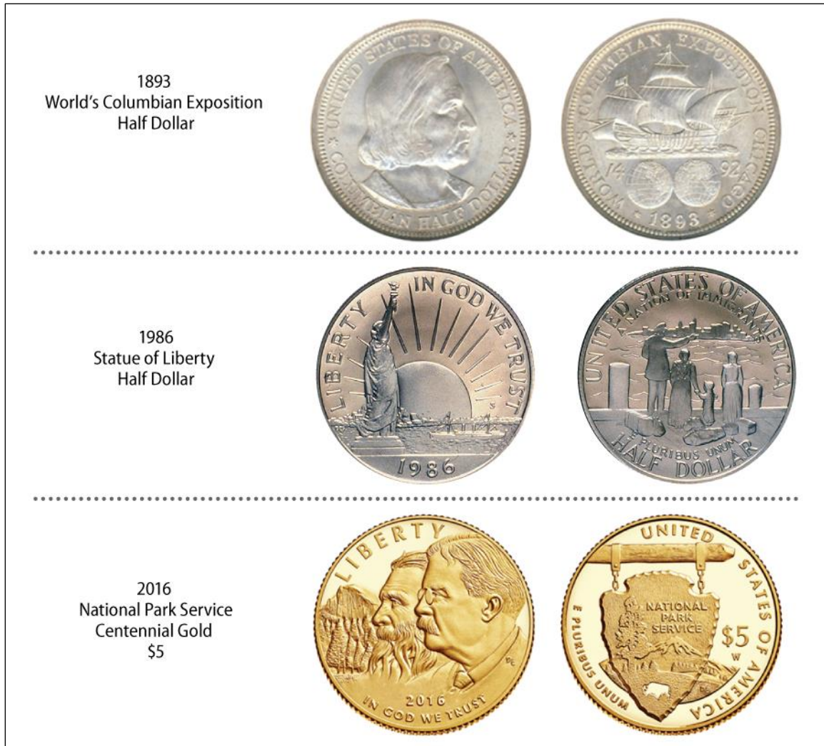
Figure 2. Examples of Commemorative Coin Designs