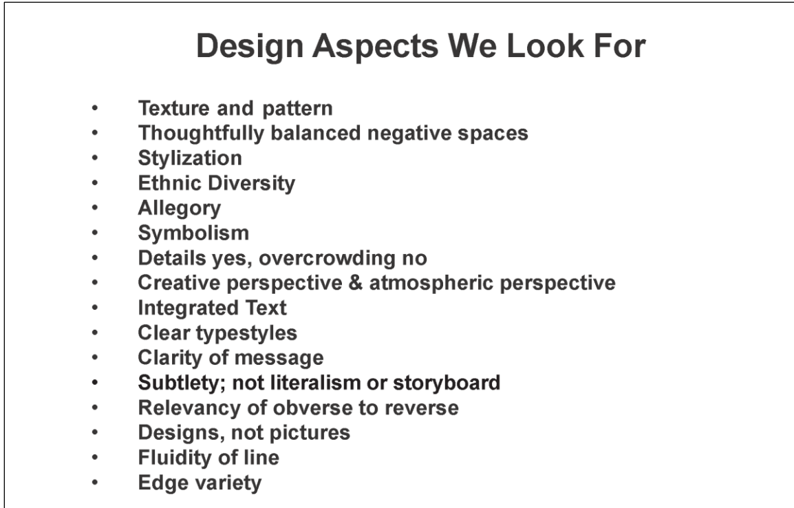
Figure 1. Citizens Coinage Advisory Committee Design Elements