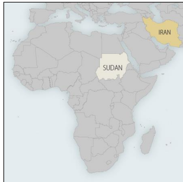
Figure 5. Sudan

Rouhani has made few statements on relations with countries in Africa and has apparently not made the continent a priority. However, the lifting of Iran sanctions could produce expanded