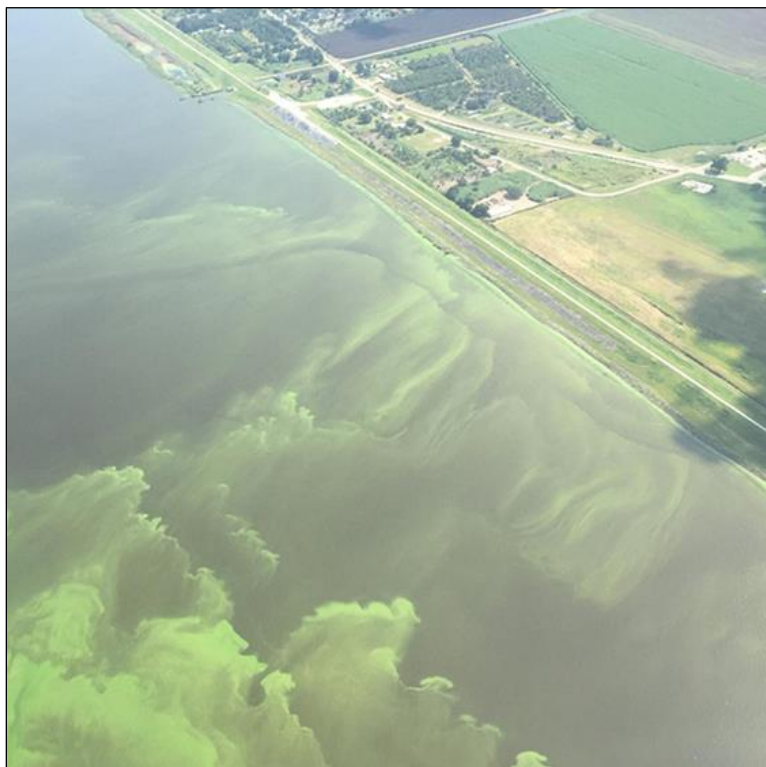
Figure 1. Aerial view of a July 2016 Harmful Algal Bloom in Lake Okeechobee, Florida