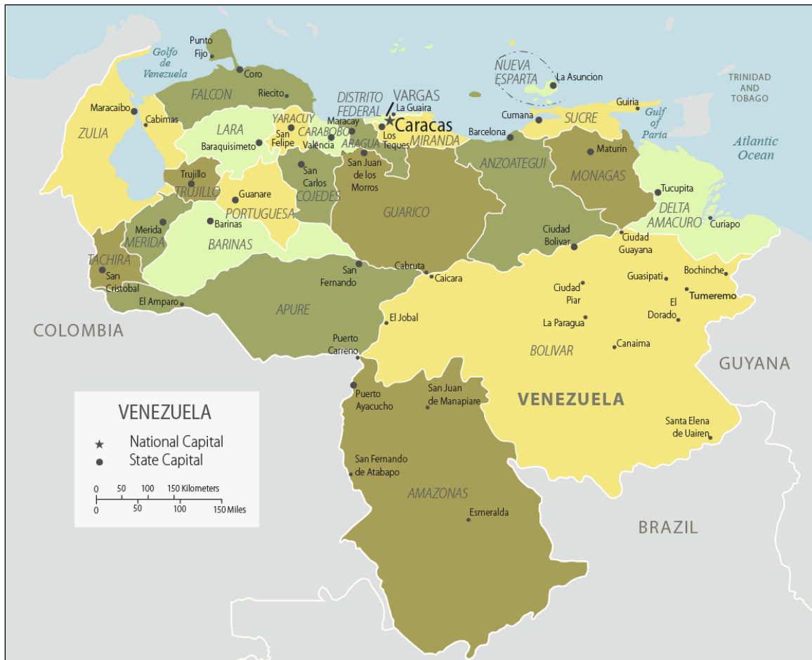
Figure I. Political Map of Venezuela