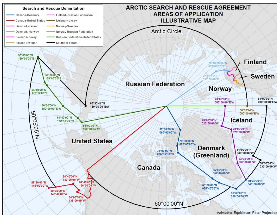
Figure 4. Illustrative Map of Arctic SAR Areas in Arctic SAR Agreement (Based on geographic coordinates listed in the agreement)