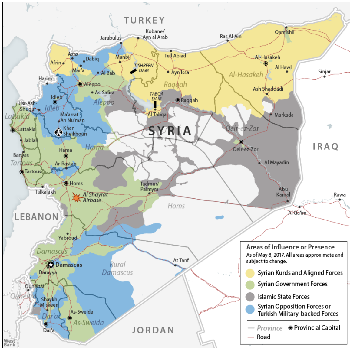
Figure 1. Syria: Areas of Influence

Source: CRS using area of influence data from IHS Conflict Monitor, last revised May 8, 2017. All areas of influence approximate and subject to change. Other sources include U.N. OCHA, Esri, and social media reports.