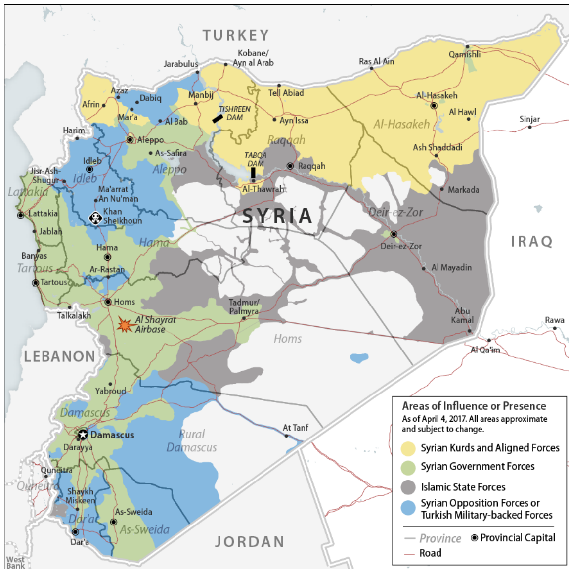
Figure I. Syria: Areas of Influence

Source: CRS using area of influence data from IHS Conflict Monitor, last revised April 4, 2017. All areas of influence approximate and subject to change. Other sources include UN OCHA, Esri and social media reports.