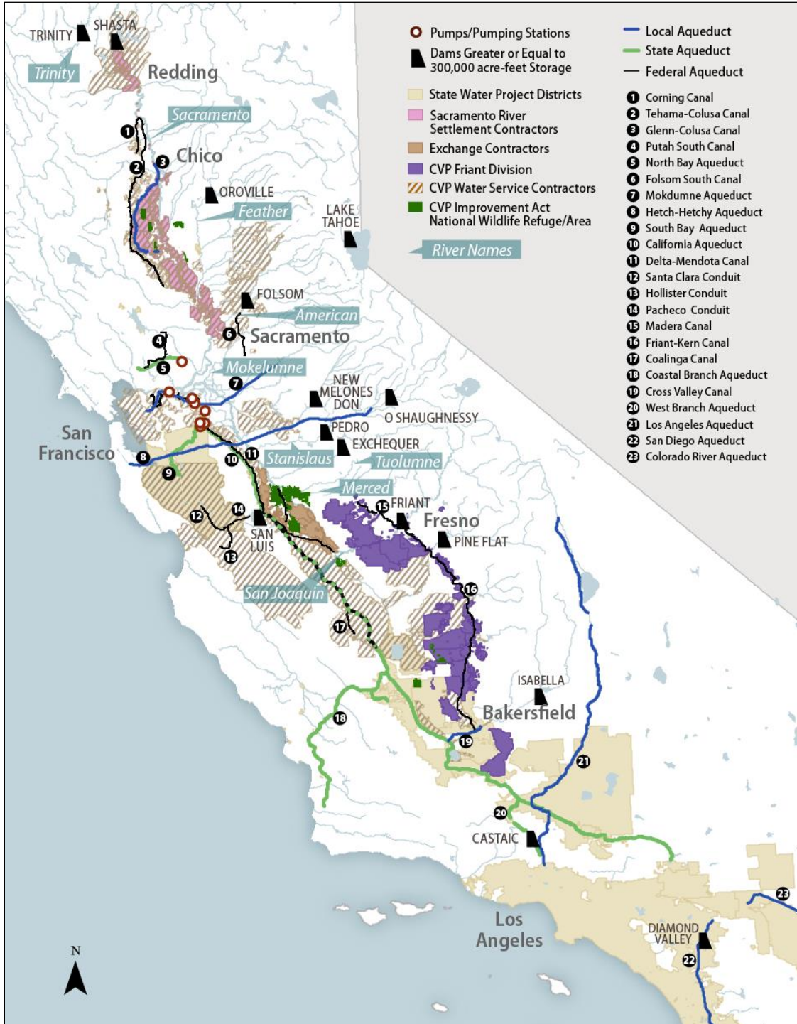
Figure I. Central Valley Project and Related Facilities