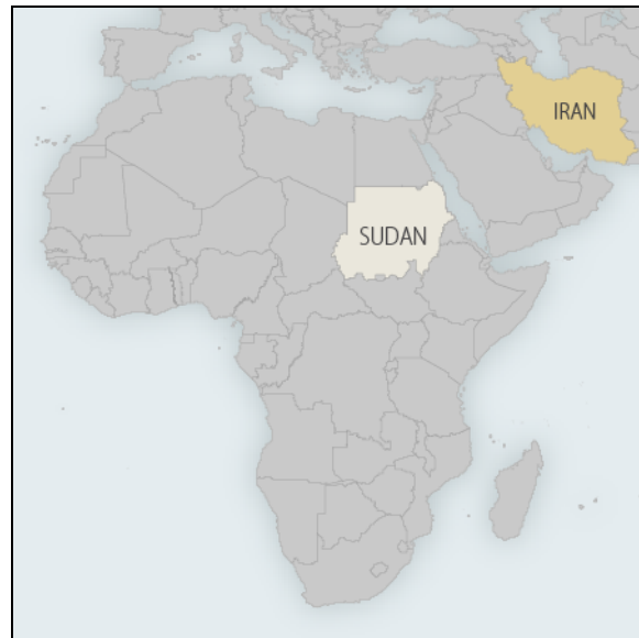
Figure 5. Sudan