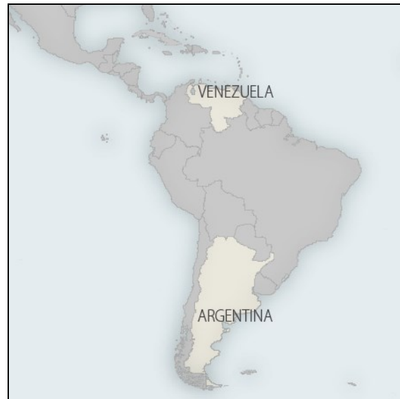
Figure 4. Latin America

Some U.S. officials and some in Congress have expressed concerns about Iran’s relations with leaders in Latin America that share Iran’s distrust of the United States. Some experts and U.S. officials have asserted that Iran has sought to position IRGC-QF operatives and Hezbollah members in Latin America to potentially carry out terrorist attacks against Israeli targets in the region or even in the United States itself. 139 Some U.S. officials have asserted that Iran and Hezbollah’s activities in Latin America include money laundering and trafficking in drugs and counterfeit goods. 140 These concerns were heightened during the presidency of Mahmoud Ahmadinejad (2005-2013), who made repeated, high-profile visits to the region in an effort to circumvent U.S. sanctions and gain support for his criticisms of U.S. policies. However, few of the economic agreements that Ahmadinejad announced with Latin American countries were implemented, by all accounts.