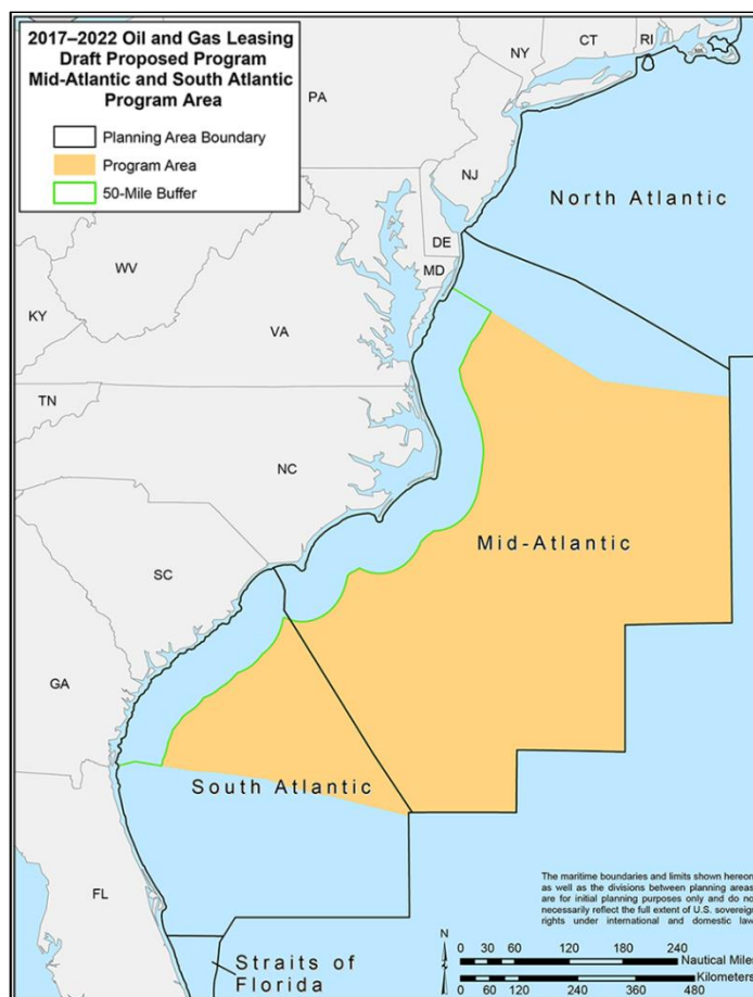
Figure 2. BOEM's Originally Proposed Program Area for Offshore Oil and Gas Leasing in the Atlantic (subsequently removed from the five-year program)