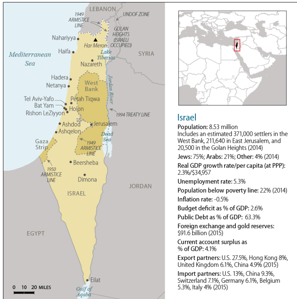
Figure I. Israel: Map and Basic Facts

Sources: Graphic created by CRS. Map boundaries and information generated by (name redacted) using Department of State Boundaries (2011); Esri (2013); the National Geospatial-Intelligence Agency GeoNames Database (2015); DeLorme (2014). Fact information from CIA, The World Factbook ; Economist Intelligence Unit; IMF World Outlook Database; Israel Central Bureau of Statistics. All numbers are estimates and as of 2016 unless specified.