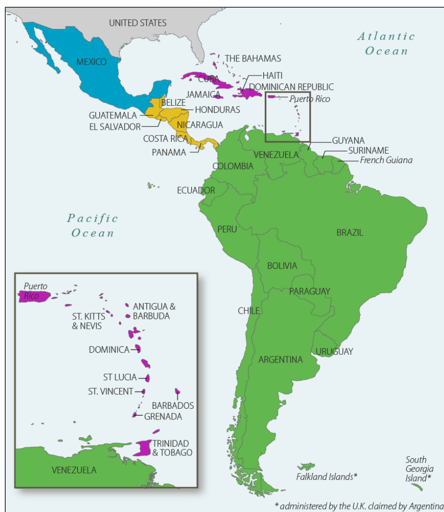
Figure I. Map of Latin America and the Caribbean