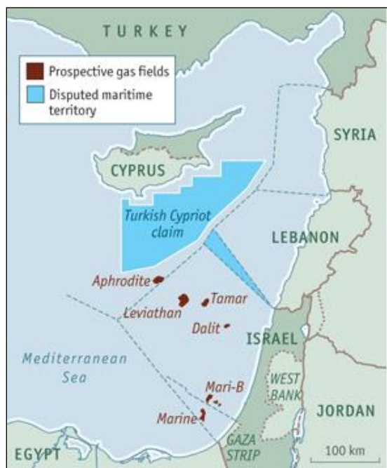
Figure 6. Eastern Mediterranean Maritime Territory Disputes and Energy Resources

In 2010, the U.S. Geological Survey estimated that there are considerable undiscovered oil and gas resources that may be technically recoverable in the Levant Basin, an area that encompasses coastal areas of Syria, Lebanon, Israel, Gaza, and Egypt and adjacent offshore waters. 60