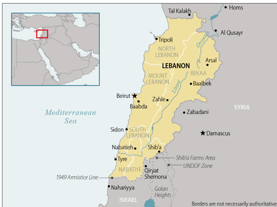
Figure 1. Lebanon at a Glance

Population: 6,237,738 (July 2016 est., includes Syrian refugees)