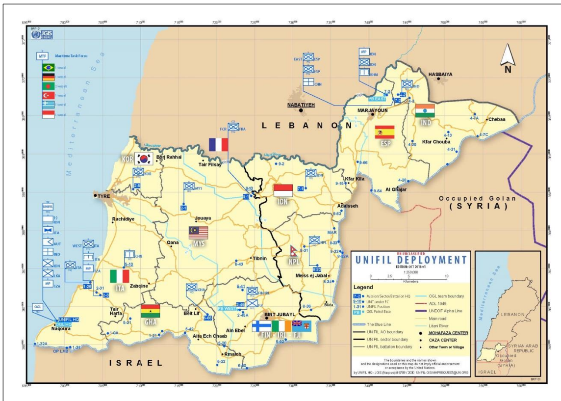
Figure 4. United Nations Force in Lebanon (UNIFIL) Deployment and Lebanon-Syria-Israel Tri-border Area