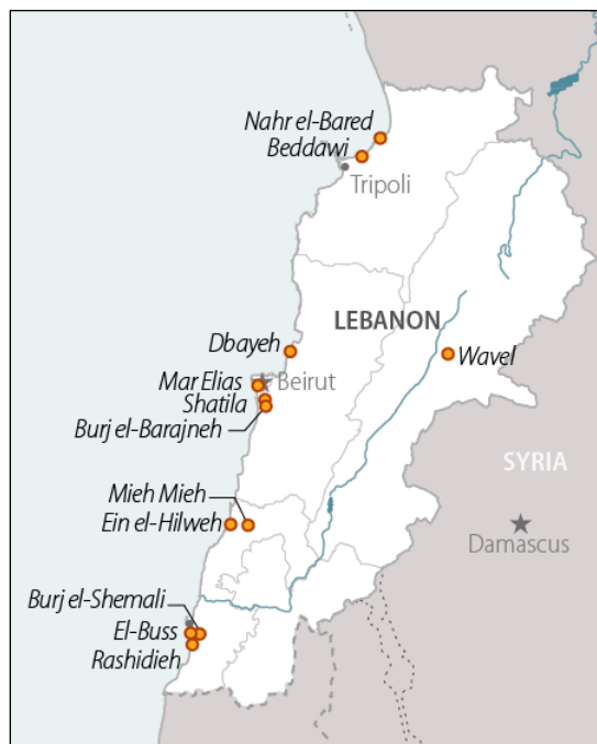
Figure 3. Palestinian Refugee Camps in Lebanon