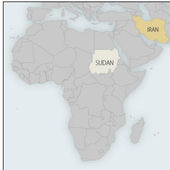
Figure 5. Sudan

The overwhelming majority of Muslims in Africa are Sunni, and Muslim-inhabited African countries have tended to be responsive to financial and diplomatic overtures from Iran's rival, Saudi Arabia. Amid the Saudi-Iran dispute in January 2016 over the Nimr execution, several