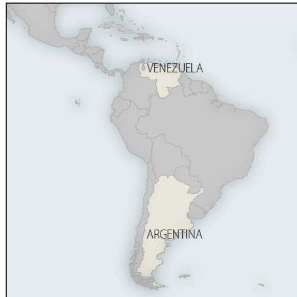
Figure 4. Latin America

President Rouhani has generally expressed only modest interest in further expanding ties in Latin America, perhaps in part because Latin America continues to account for less than 6% of Iran's total imports. 144 He made his first visit to the region in September 2016—three years into his presidency—in the course of traveling to the annual U.N. General Assembly meetings in New York. He went to several of the countries that Foreign Minister Zarif did when Zarif met with leaders in Cuba, Chile, Bolivia, Ecuador, Nicaragua, and Venezuela in August 2016—the countries in that region that Ahmadinejad visited during his presidency as well. Iran's officials have stated that the purpose of the visits were to expand economic relations with Latin American countries now that international sanctions on Iran have been lifted.