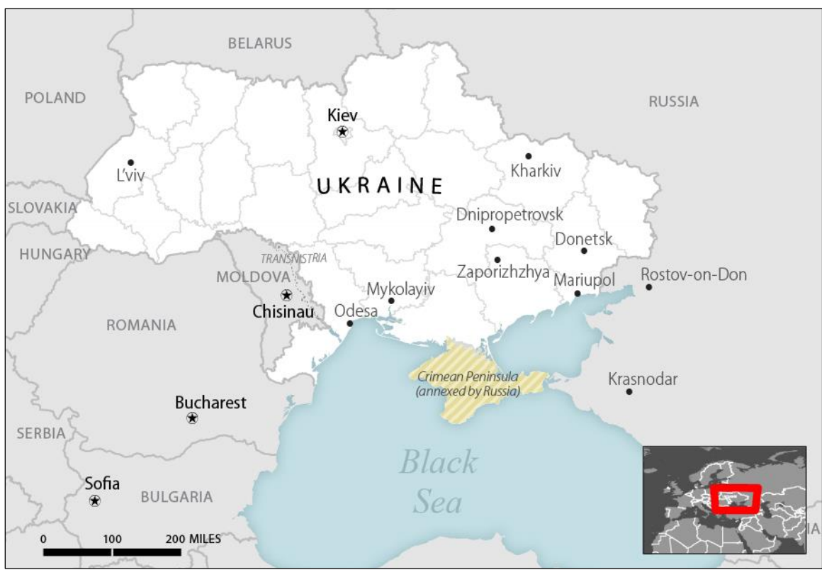
Figure 1. Ukraine