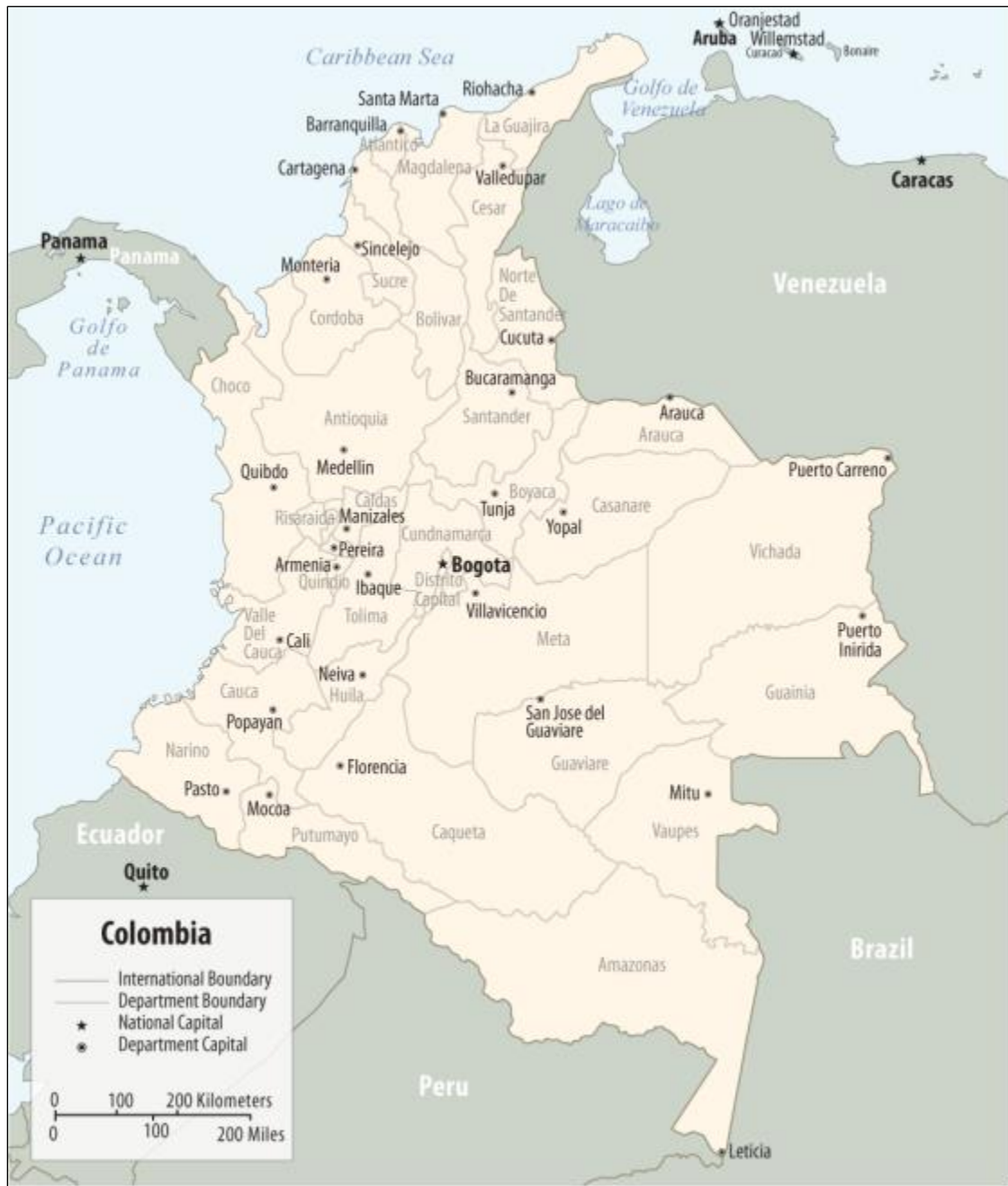
Figure I. Map of Colombia Showing Departments and Capital