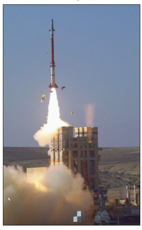
Figure 6. David's Sling launches Stunner Interceptor

According to the FY2016 Consolidated Appropriations Act (P.L. 114-113), of the total amount appropriated for David's Sling, $150