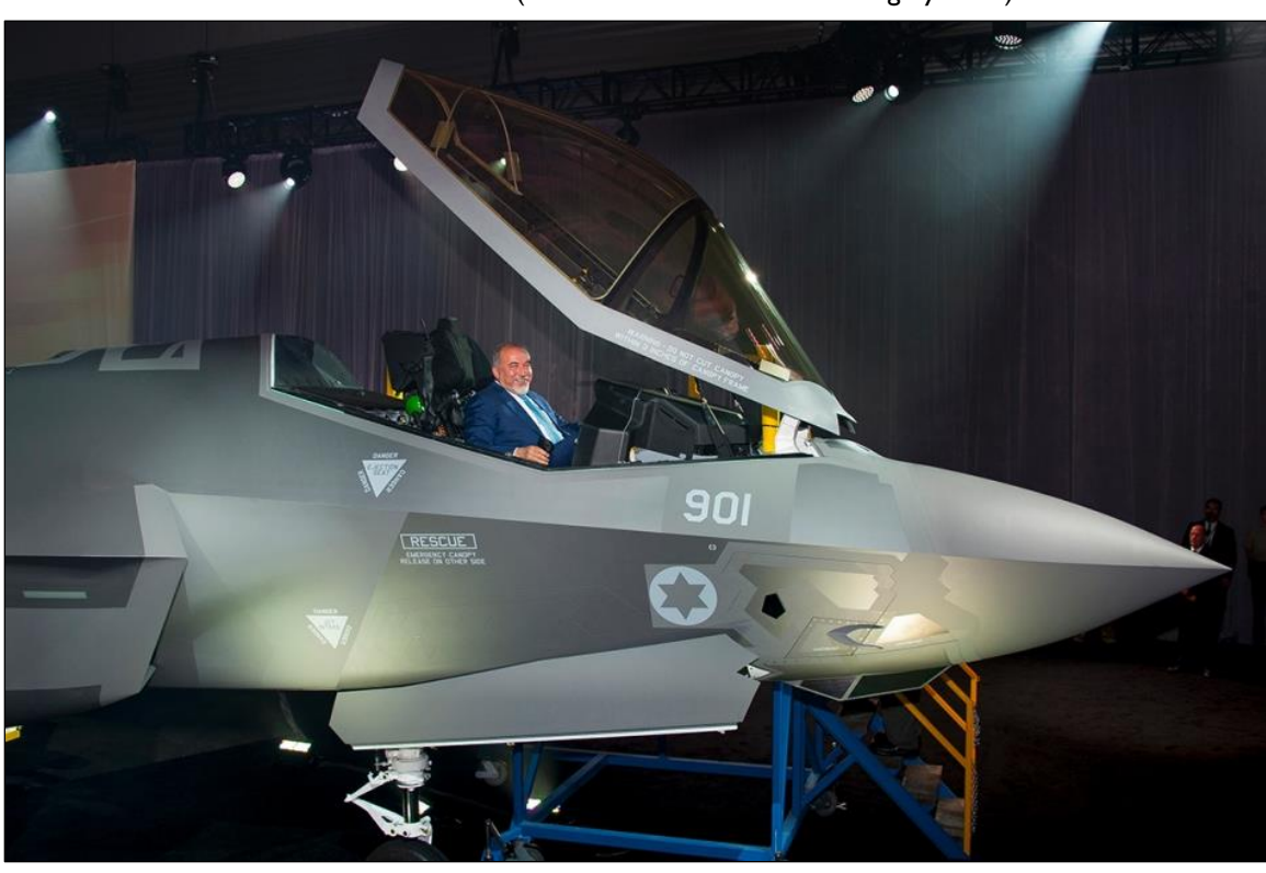
Figure 4. The Israeli Variant of the F-35A Lightning II

Known as the "Adir" (translated from Hebrew as 'Mighty One')