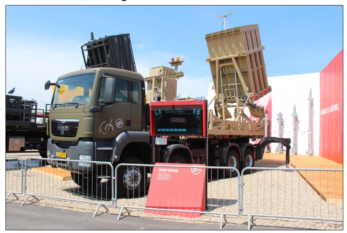
Figure 5. Iron Dome Launcher

In September 2016, an Iron Dome battery stationed in the Israeli-controlled Golan Heights intercepted two stray projectiles fired from Syrian territory, marking the first instance when Iron Dome was used to defend Israeli territory against threats emanating from the Syria conflict.