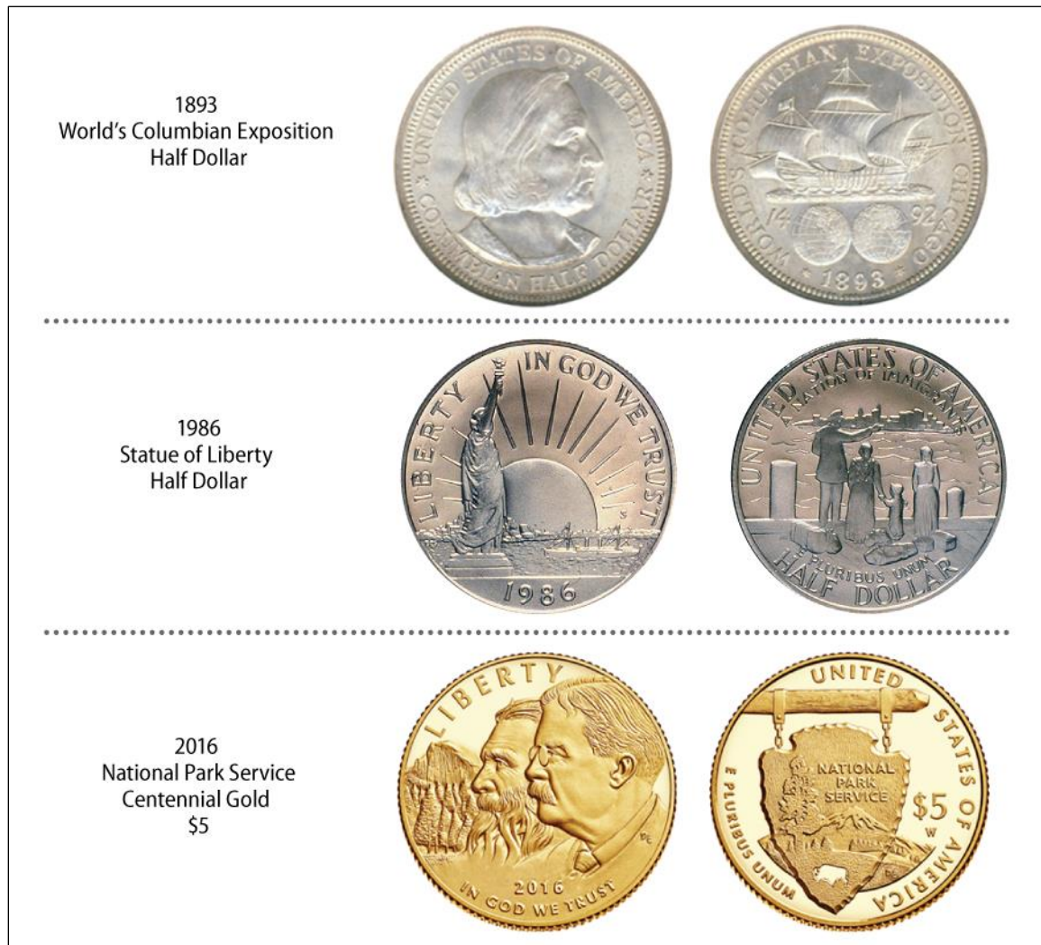
Figure 2. Examples of Commemorative Coin Designs

Source: "Columbian Exposition Half Dollar," Early Commemorative Coins , at http://earlycommemorativecoins.com/1892-columbian-half-dollar ; U.S. Department of the Treasury, U.S. Mint, "1986 Statue of Liberty Half Dollar," at https://www.usmint.gov/about_the_mint/CoinLibrary/index.cfm#statueLib ; and U.S. Department of the Treasury, U.S. Mint, "2016 National Park Service 100 th Anniversary Commemorative Coin Program: Gold Obverse and Reverse," at https://www.usmint.gov/pressroom/?action=photo#NPSCentennial .