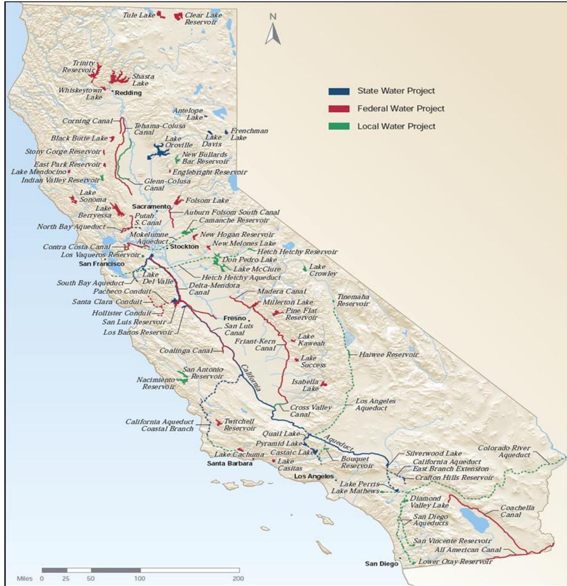
Figure 1. Central Valley Project, State Water Project, and Related Facilities