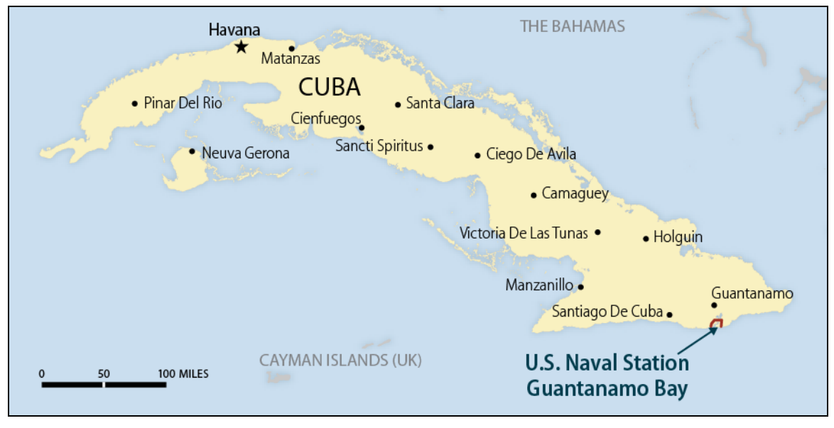
Figure I. Naval Station Guantanamo, Cuba

Map created by Bisola Momoh, Visual Information Specialist.