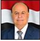
Table I. Yemen Profiles