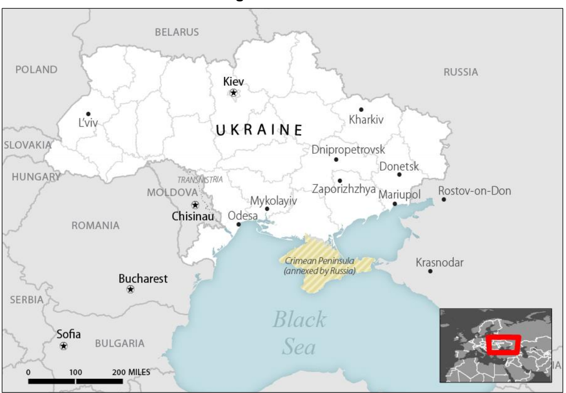
Figure I. Ukraine