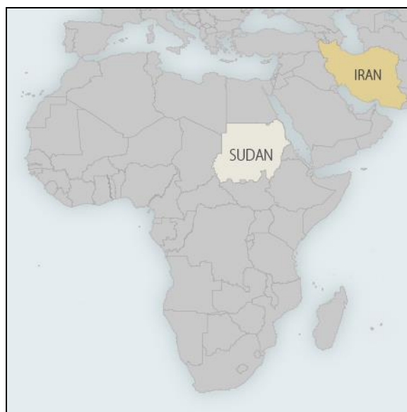
Figure 5. Sudan

The overwhelming majority of Muslims in Africa are Sunni, and Muslim-inhabited African countries have tended to be responsive to financial and diplomatic overtures from Iran's rival, Saudi Arabia. Amid the Saudi-Iran dispute in January 2016 over the Nimr execution, several African countries broke relations with Iran outright, including Djibouti, Comoros, and Somalia,