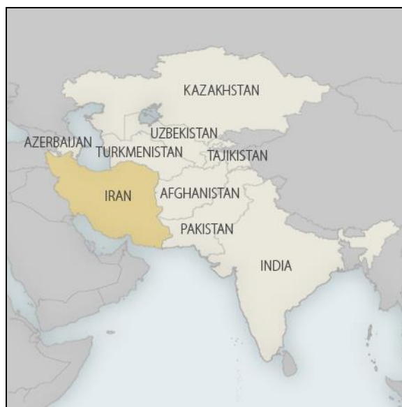
Figure 3. South and Central Asia Region

Most of the Central Asia states that were part of the Soviet Union are governed by authoritarian leaders and Iran has little opportunity to exert influence by supporting opposition factions. Afghanistan, on the other hand, remains politically weak and divided and Iran is able to exert influence there. Some countries in the region, particularly India, apparently seek greater integration with the United States and other world powers and, until the implementation of the JCPOA in January 2016, limited or downplayed cooperation with Iran. The following sections cover those countries in the Caucasus and South