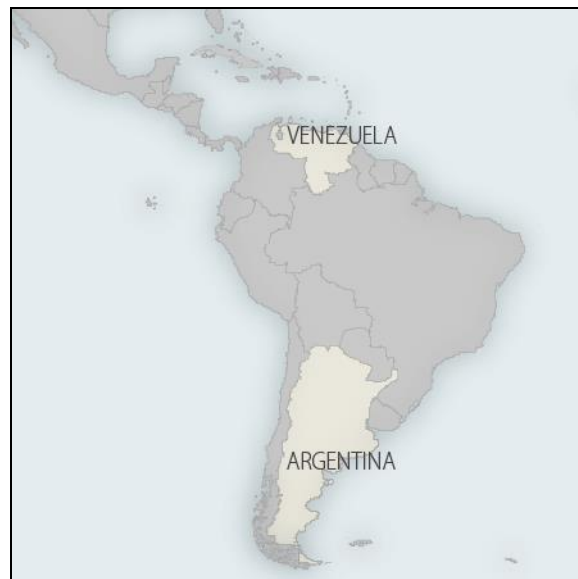
Figure 4. Latin America

Some U.S. officials and some in Congress have expressed concerns about Iran's relations with leaders in Latin America that share Iran's distrust of the United States. Some experts and U.S. officials have asserted that Iran has sought to position IRGC-QF operatives and Hezbollah members in Latin America to potentially carry out terrorist attacks against Israeli targets in the region or even in the United States itself. 142 Some U.S. officials have asserted that Iran and Hezbollah's activities in Latin America include money laundering and trafficking in drugs and counterfeit goods. 143 These concerns were heightened during the presidency of Mahmoud Ahmadinejad (2005-2013), who made repeated, high-profile visits to the region in an effort to circumvent U.S. sanctions and gain support for his criticisms of U.S. policies. However, few of the economic agreements that Ahmadinejad announced with Latin American countries were implemented, by all accounts.