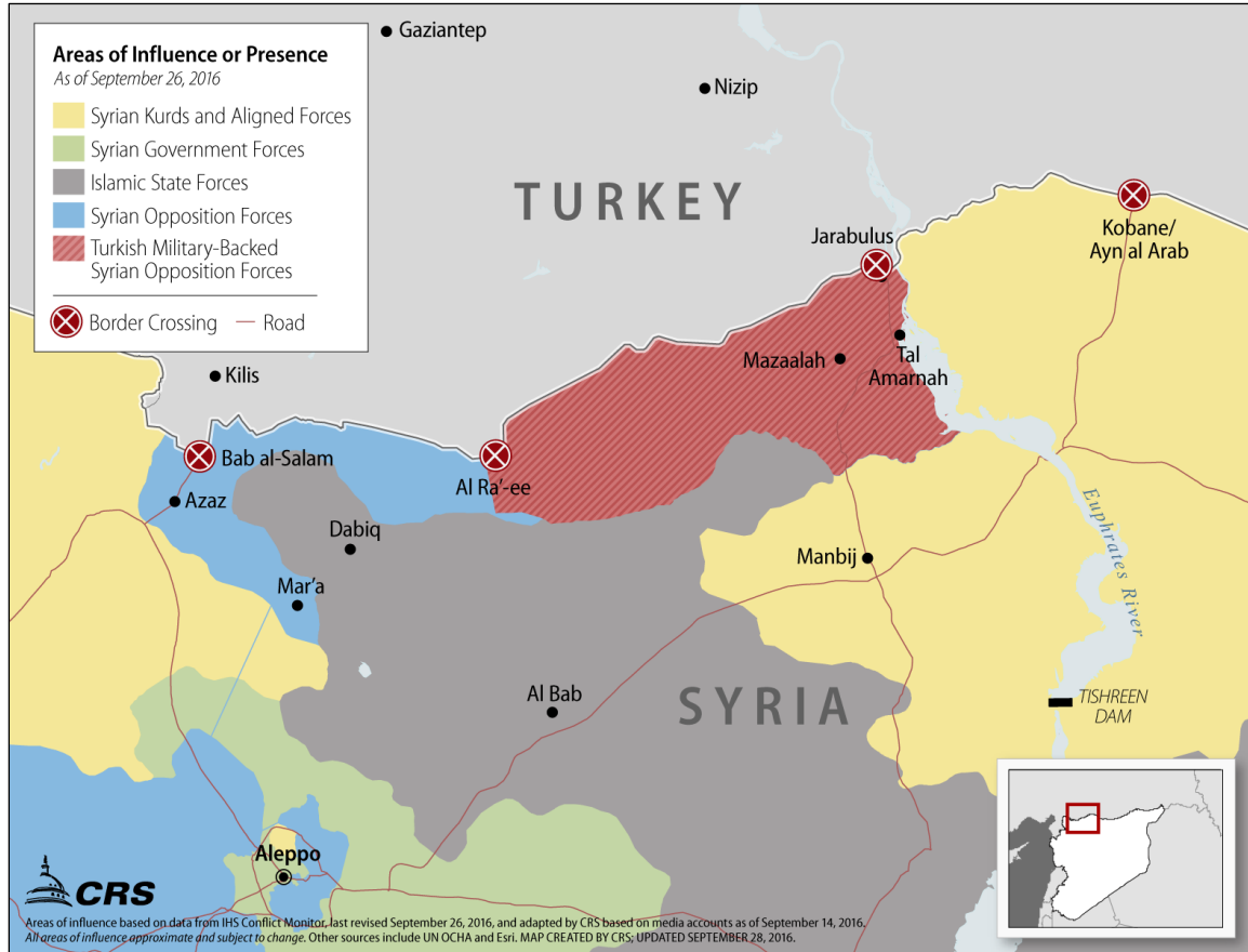
Figure 2. Syrian-Turkish Border

Russian airstrikes. These Russian strikes, as well as the Syrian airstrikes against Kurdish forces in Al Hasakah, highlight one of the key issues in the policy debate on Syria—that of how the United States should respond to strikes against U.S.-backed forces.