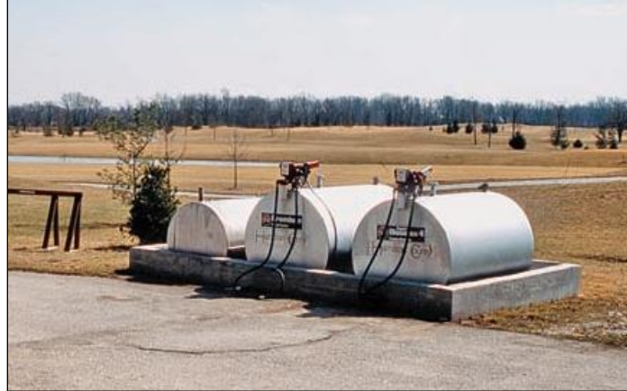
Figure I. Illustrative Example of Oil Storage Units