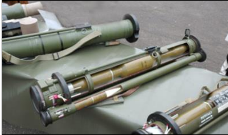
Figure 1. Russian RPG-30