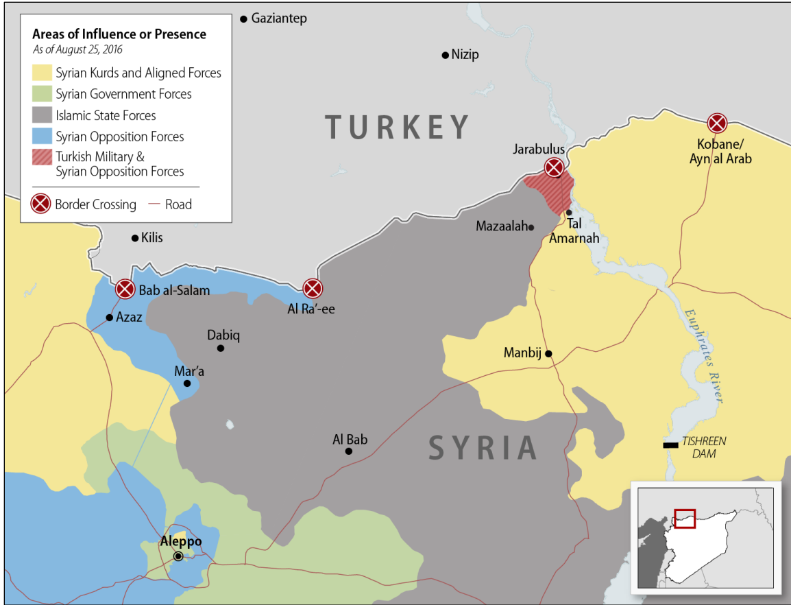
Figure 5. Northern Syria: Areas of Control