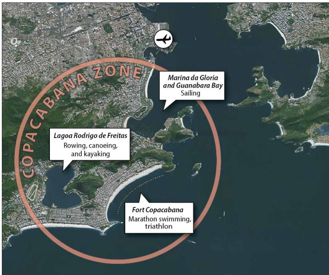
Figure 3. Rio2016™ Water Venue Locations