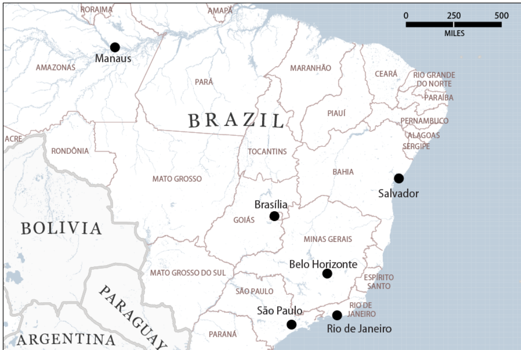
Figure 2. Olympic Venues for Soccer 2016 Rio Games